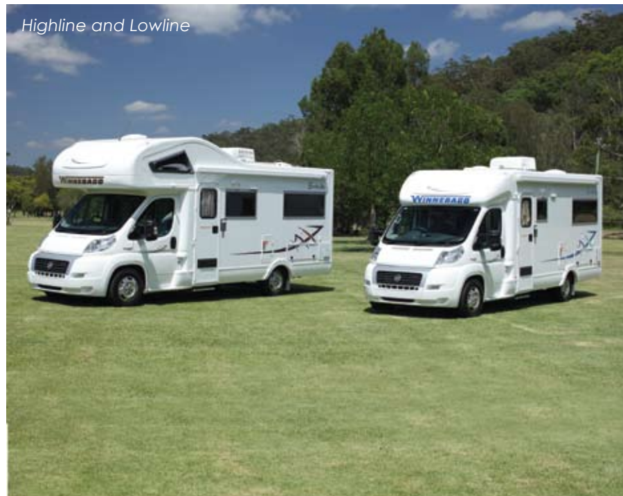
Highline and Lowline