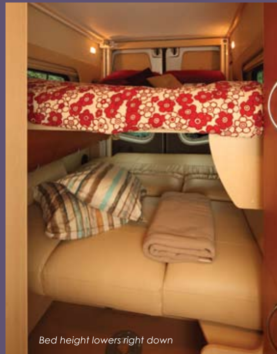
Bed height lowers right down