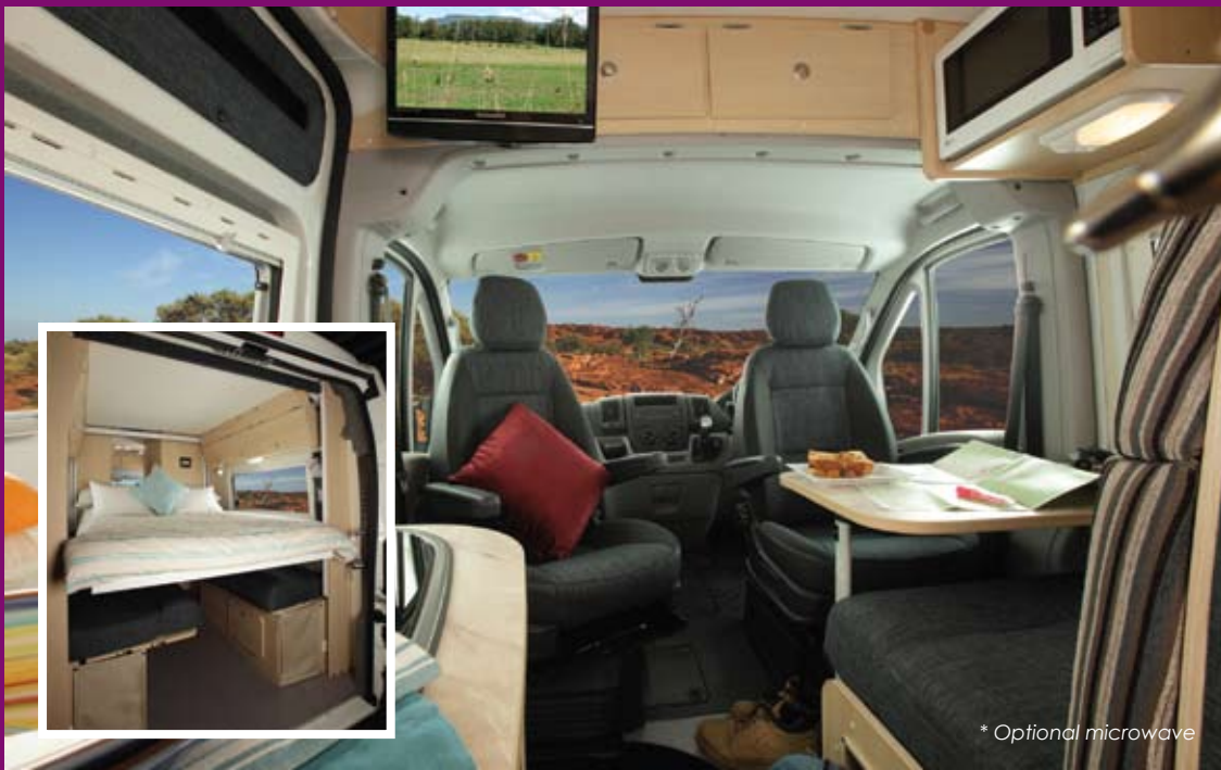
* Optional microwave