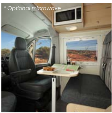
* Optional microwave